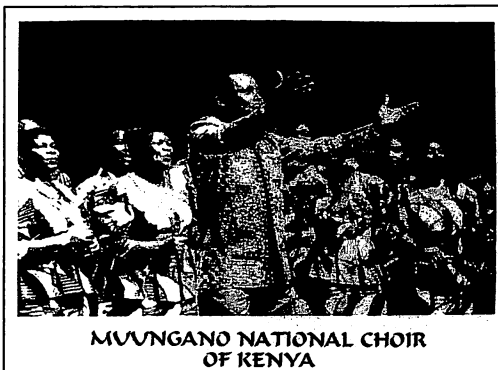
MUUNGANO NATIONAL CHOIR OF KENYA

( Hoyahe is a word used to express extreme happiness )